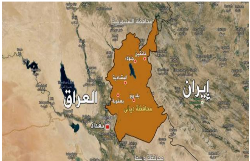
Diyala: Al- Muqdadiya Region /map

exposing a large number of poor people to food insecurity. The current escalation of armed conflict in Iraq particularly in Central region of Iraq resulted in a precarious and dangerous humanitarian situation leading in deterioration of both accessibility and the quality of essential services. An estimated 2,100,000 Iraqis have been displaced since the beginning of 2014 as a result of the ongoing conflict in Iraq. In addition, many people still staying in conflict affected areas and host families are either already food insecure or at risk of becoming food insecure very soon as the impact of the conflict worsens. On Rural Women Livestock is one of the pillars of economic fundamentals in the agricultural sector. The most important assets found in Diyala are cattle, sheep, goats and buffaloes. The livestock sector has been affected to a great extent by the current events in Diyala. Insecurity and fighting, together with difficulties faced.